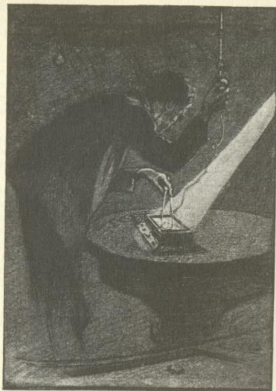
"THE PICTURE PASSED TO AND FRO LIKE AN AGITATED PANORAMA."

raised his conning-tower, step up his ladder until his engineers could see nothing of him above the waist, and then come down again with orders. Two small electric lights were all the illumination of this space—they were placed to make him most clearly visible to his subordinates; the air was thick with the smell of oil and petrol, and had the war correspondent been suddenly transferred from the spacious dawn outside to the bowels of this apparatus he would have thought himself fallen into another world.