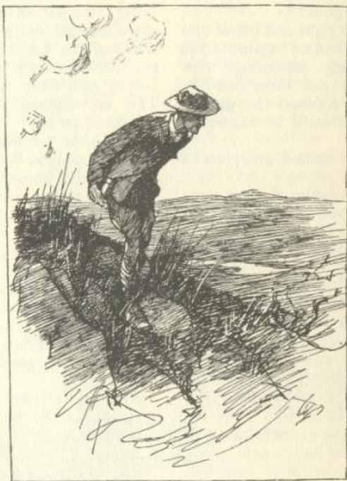
"HE DECIDED TO FOLLOW THE GULLY."

These were in the first place automatic, ejected their cartridges and loaded again from a magazine each time they fired, until the ammunition store was at an end, and they had the most remarkable sights imaginable, sights which threw a bright little camera-obscura picture into the light-tight box in which the rifleman sat below. This camera-obscura picture was marked with two crossed lines, and whatever was covered by the intersection of these two lines, that the rifle hit. The sighting was ingeniously contrived. The rifleman stood at the table with a thing like an elaboration of a draughtsman's dividers in his hand, and he opened and