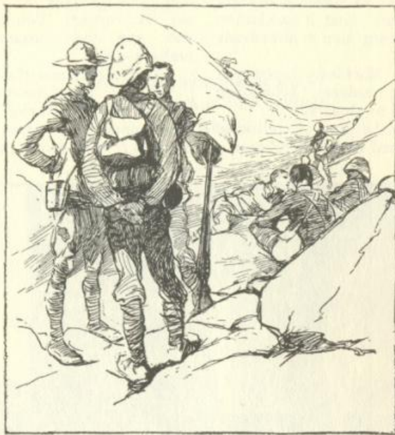
"HE HAD SPENT SOME HOURS IN THE COMPANY OF A SQUAD OF DISPIRITED RIFLEMEN."

In the middle distance three or four men and horses were receiving medical attendance, and a little nearer a knot of officers regarded the distant novelties in mechanism with profound distaste. Everyone was very distinctly aware of the twelve other ironclads, and of the multitude of townsmen soldiers, on bicycles or afoot, encumbered now by prisoners and captured war-gear but otherwise thoroughly effective, who were sweeping