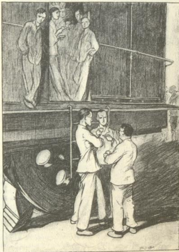
"SOMETHING NOT ALTOGETHER DEGRADED BELOW THE LEVEL OF A MAN."

And he was much too good a journalist to spoil his contrast by remarking that the half-dozen comparatively slender young men in blue pyjamas who were standing about their victorious land ironclad, drinking coffee and eating biscuits, had also in their eyes and carriage something not altogether degraded below the level of a man.