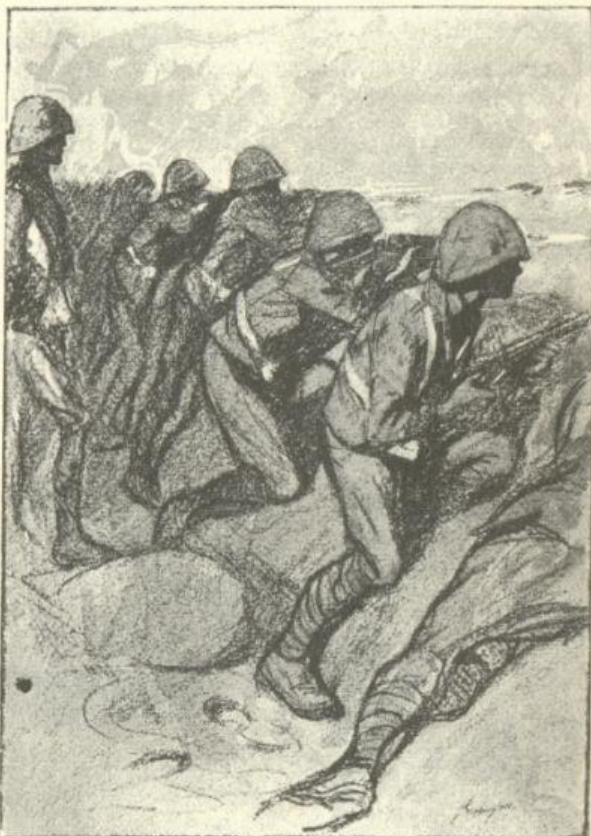
"THE MEN ABOUT HIM STUCK TO THEIR POSITION AND FIRED FURIOUSLY."

The lean man continued speaking for a word or so, then gave it up, shook his head to enforce the impossibility of anything crossing a trench like the one below, and resumed business once more.