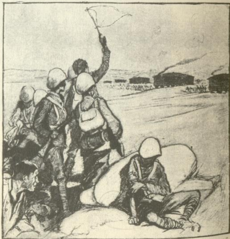
"HERE AND THERE STOOD LITTLE CLUMPS OF MEN, OUTFLANKED AND UNABLE TO GET AWAY."

more than a hundred feet or so above the general plain, but in this flat region it sufficed to give the effect of extensive view. Away on the north side of the ridge, little and far, were the camps, the ordered waggons, all the gear of a big army; with officers galloping about and men doing aimless things. Here and there men were falling-in, however, and the cavalry was forming up on the plain beyond the tents. The bulk of men who had been in the trenches were still on the move to the rear, scattered like sheep without a shepherd over the farther slopes. Here and there were little rallies and attempts to wait and do—something vague; but the general drift was away from any concentration. Then on the southern side was the elaborate lacework of trenches and defences, across which these iron turtles, fourteen of them spread out over a line of perhaps three miles, were now advancing as fast as a man could trot, and methodically shooting down and breaking up any persistent knots of resistance. Here and there stood little clumps of men, outflanked and unable to get away, showing the white flag, and the