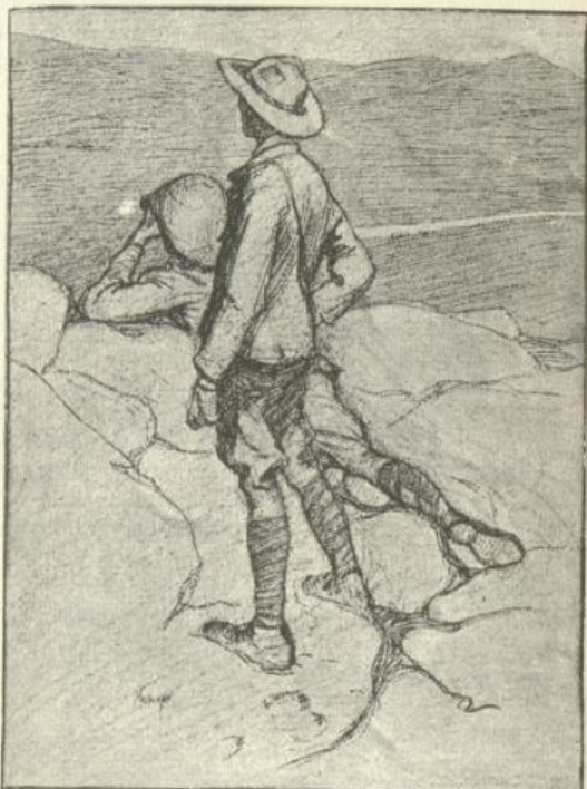
"'BOOM!' CAME FROM SOMEWHERE FAR AWAY TO THE LEFT."

The lieutenant shook his head. "There's nothing to see," he apologized, and then went down to where his little squad of sun-brown, loose-limbed men had been yarning in the trench. The war correspondent stood up also, glanced for a moment at the business-like bustle below him, gave perhaps twenty seconds to those enigmatical trees again, then turned his face toward the camp.